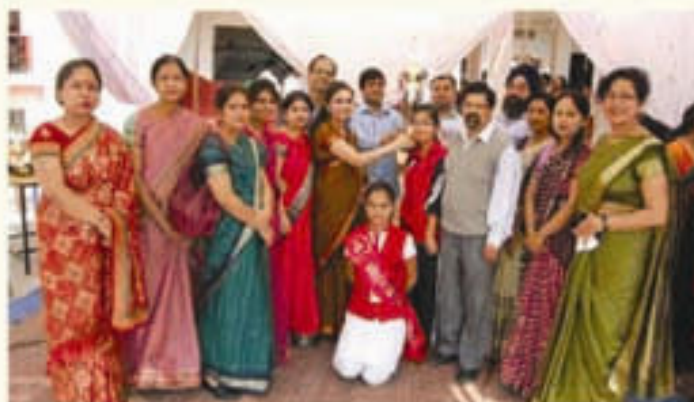
House Trophy Won by Happiness House